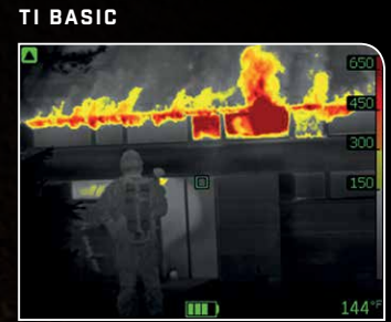
For initial fire attack and life rescuing operations.

FSX™ - FLEXIBLE SCENE ENHANCEMENT Details in the thermal image are enhanced through digital image processing inside the camera. The result is an ultra-sharp thermal image that shows more detail. FSX makes it easier for firefighters to find their way in smoke filled rooms. Even in scenes with extreme temperature dynamics that are typical for a firefighting environment.