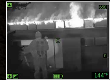
Same as the TI Basic mode but a grey scale image.