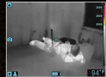
For use with lower temperature situations, such as initial rescue efforts after traffic accidents, searches in wooded landscapes, etc.