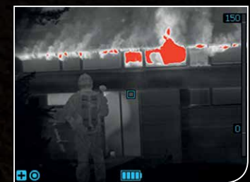
Used for finding hotspots. The hottest 20% of the scene is colored in red.