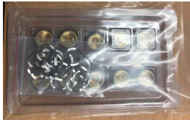
Figure 5 – 30 x Washers per pack of 10 Caps

Wave washers are currently available as a spare part - #94255. As of September 2019, three (3) additional washers will be supplied for each replacement F3 cap – Part # 46127 (MOQ x 10).