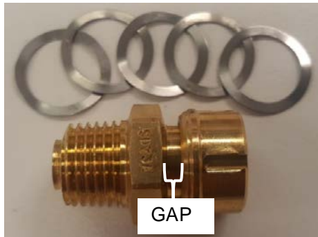
Figure 3 – Washers to be packed

With the majority of nozzle caps that were tested, the width of the insert was preventing the cap from screwing down and securing the shroud. The additional wave washers are required to fill the gap (Figure 3). Additional vibration and shock testing has been carried out on nozzle assemblies and the results show that up to 5 washers can be used to secure a replacement cap.