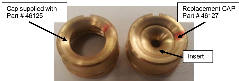
Figure 2 – Caps with foils removed

The PEFS F3 nozzle cap is a spare part that incorporates a foil seal. The foil seal is secured by an additional insert (See Figure 2 – cap on the right) which allows the foil seal it to be handled and fitted in the field.