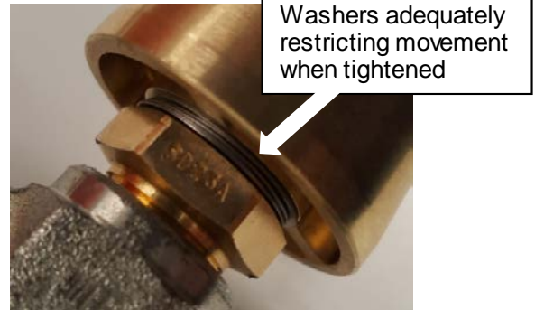
Figure 4 – Washers fitted

Wave washers are currently available as a spare part - #94255. As of September 2019, three (3) additional washers will be supplied for each replacement F3 cap – Part # 46127 (MOQ x 10).